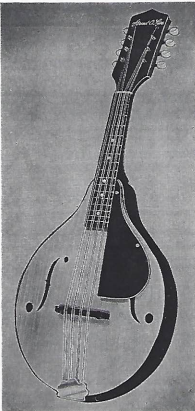
Nos. G11 - G15