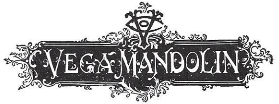
Style No. 1